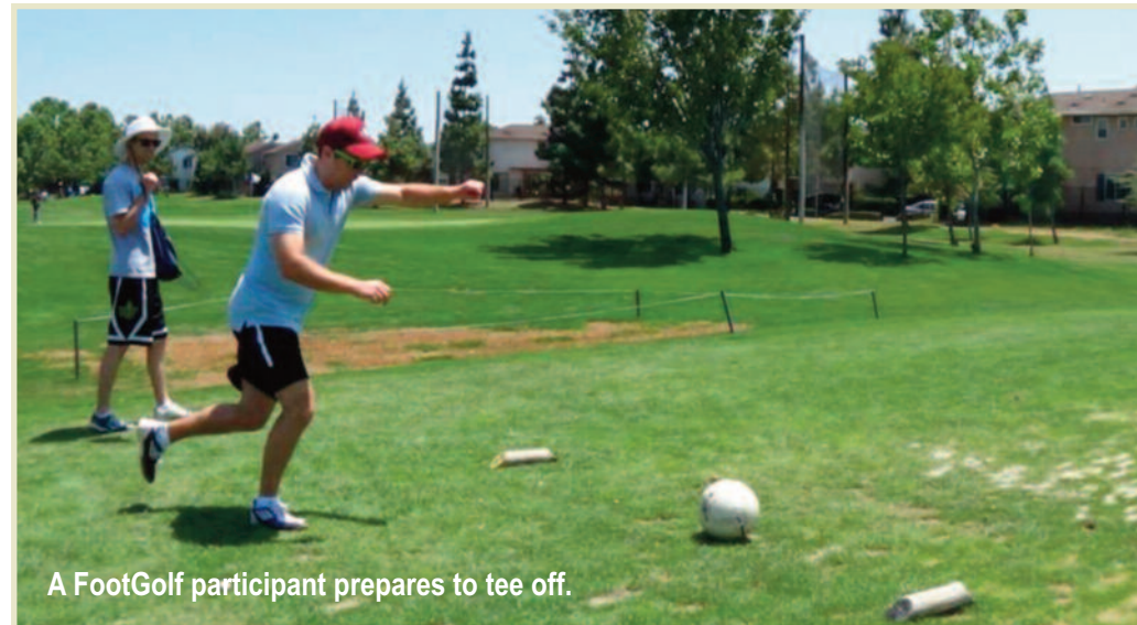
A FootGolf participant prepares to tee off.

The 2014 FootGolf Classic, which sold out, was presented by The First Tee of Silicon